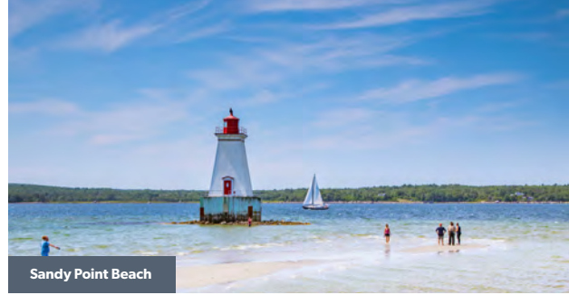
Sandy Point Beach

The South Shore is known for its sprawling white sand beaches, many of which are at provincial parks, including Bayswater Beach, Carter's Beach, Rissers Beach, Summerville Beach, Thomas Raddall, and Sand Hills. The calmer ocean waters at Beach Meadows Municipal Beach are great for young children. At The Hawk Beach on Cape Sable Island, the most southerly point in Nova Scotia, keep an eye out for the "drowned forest" and migratory birds.