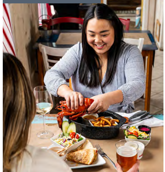
Capt. Kat's Lobster Shack, Barrington