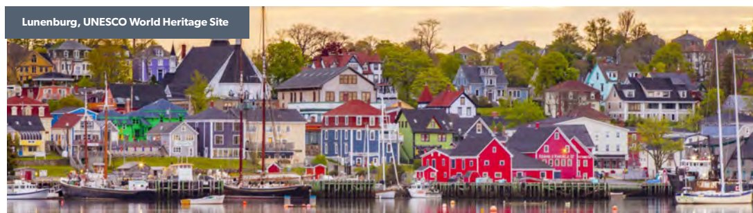
Lunenburg, UNESCO World Heritage Site

This region is home to some of our most popular historic attractions and sweeping coastal views. Explore our coast, culture, and the many vibrant South Shore communities.