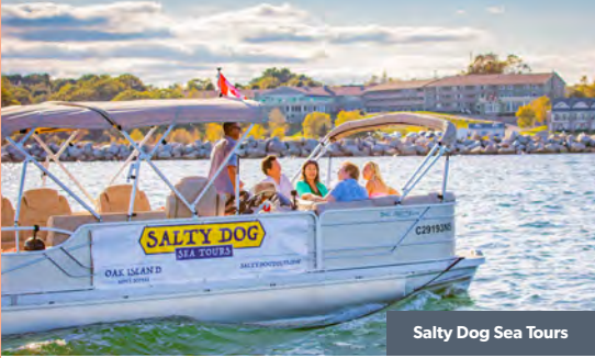
Salty Dog Sea Tours