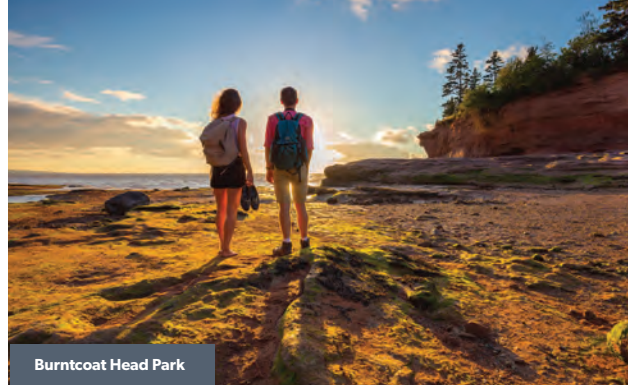
Burntcoat Head Park

Exhibits focus on the social history of Colchester County; the museum’s genealogical resources include family and community histories, photographs, and archival papers.