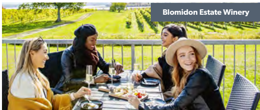
Blomidon Estate Winery

Craft beer connoisseurs will enjoy visiting the variety of breweries in this region. Visit Lunn's Mill Beer Company, Horton Ridge Malt House, Bay of Fundy Brewing Co., Annapolis Brewing Company, Roof Hound Brewing Co., Sea Level Brewing, Bent Nail Brewery, Schoolhouse Brewery, The Church Brewing Company, Two Islands Brewing, or Lazy Bear Brewing to discover a new favourite!