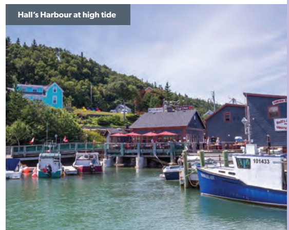
Hall's Harbour at high tide

This charming fishing community along the Bay of Fundy is a favourite stop for photos. Visit at low tide to snap fishing boats resting on the ocean floor.