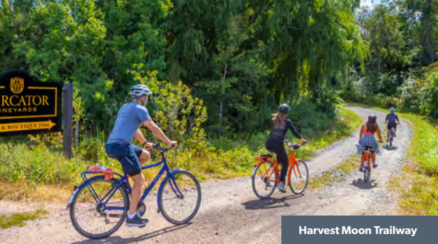
Harvest Moon Trailway