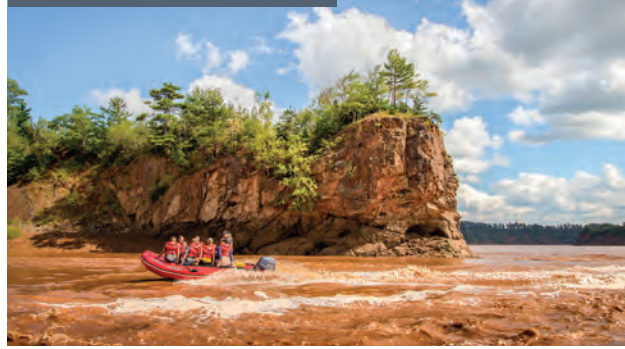
Tidal bore rafting, Shubenacadie River

Winding through a deep gorge, a bubbling stream leads to two waterfalls in this 3000-acre natural park in the centre of town, with great hiking and biking trails.