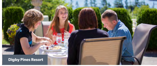
Digby Pines Resort