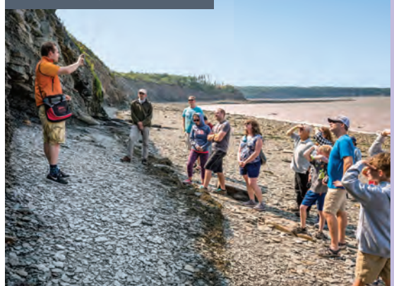
Guided tour of Joggins Fossil Cliffs

Once named Canada's Garden of the Year, this beautiful 17-acre site in a tranquil setting overlooks a tidal river valley is home to the largest rose collection in Eastern Canada. Visitors will also find a reconstructed 1671 Acadian house on site.