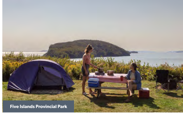
Five Islands Provincial Park