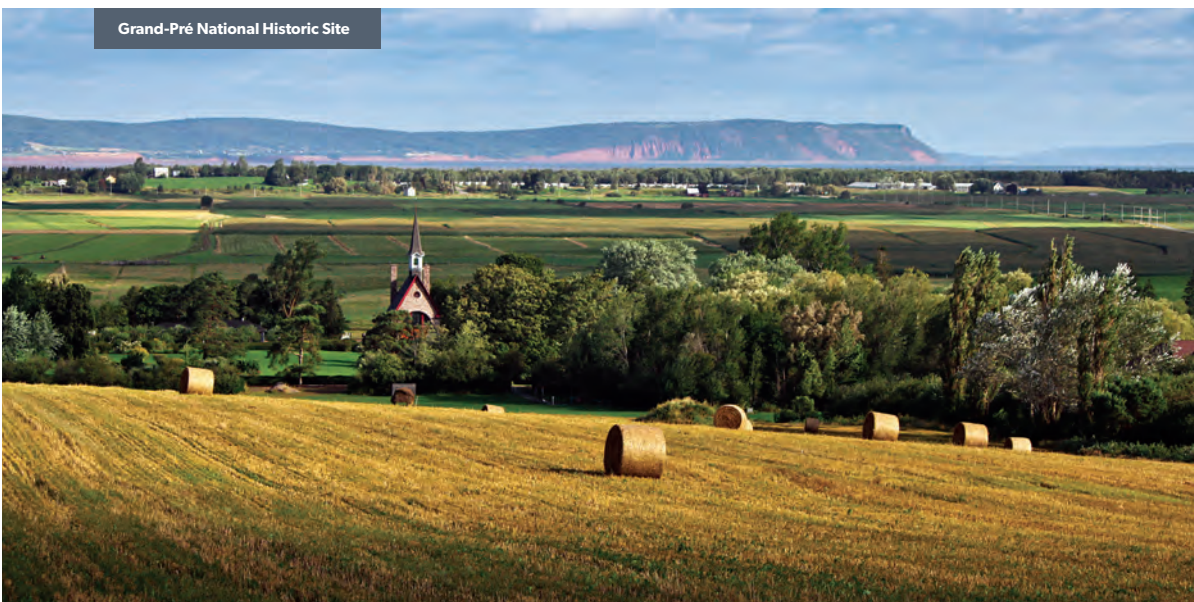
Grand-Pré National Historic Site

Built in 1835, explore the unique and elegant features of the house and sprawling 34-acre grounds. Take a 1 kilometre self-guided tour on the fully accessible trail, play a game of disc golf, and visit the Birthplace of Hockey Museum, also on site, to view the collection of hockey memorabilia. Enjoy cross county skiing, snowshoeing, walking and other non-motorized transportation throughout the trails on the grounds during the winter months.