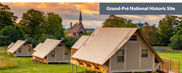
Grand-Pré National Historic Site

Feel the rush of riding eight to 20+ foot waves in a white-water Zodiac boat as the surging power of the Bay of Fundy's tides turns the Shubenacadie River into a roller coaster on water, just 30 minutes from Truro. Explore hiking trails like at Cape Split, Cape Chignecto or Blomidon Provincial Parks, leading to incredible vistas that overlook the Bay of Fundy, walk on the ocean floor and watch for whales off Digby Neck and Islands.