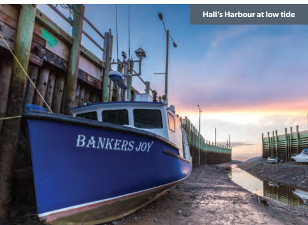
Hall's Harbour at low tide

This scenic, three hour guided tour with Local Guy Adventures takes you 4 kilometres through one of three slot canyons in the province; marvel at 200-foot canyon walls as you go. Experience this hike through old growth forest, past waterfalls, over lush, mossy forest bed at any time of year. Snowshoes available during winter.