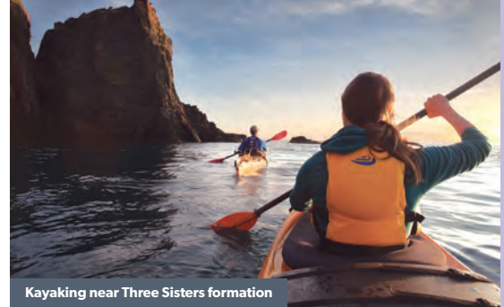
Kayaking near Three Sisters formation