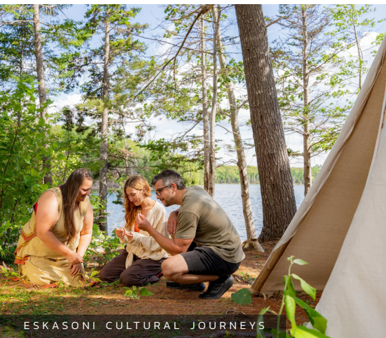
ESKASONI CULTURAL JOURNEYS